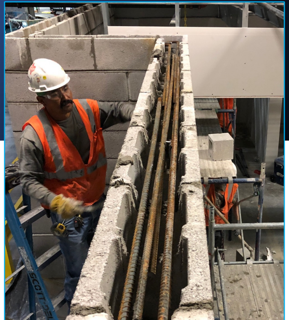
Excavating | Concrete